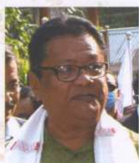
Dr. Ranaj Pegu Hon'ble Education Minister, Govt. of Assam