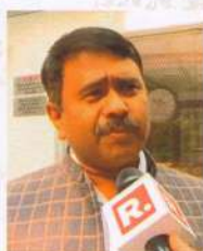
Abdul Khaleque Hon'ble MP, Barpeta HPC